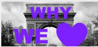
80 Reasons To Be Pretty Damn Euphoric You Attend New York University