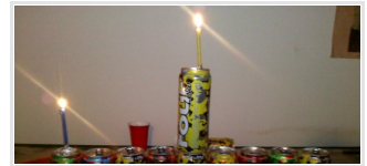
Eight Crazy Nights: Doing Hanukkah In The Dorms

« Failed Sting Operation Exposes Muslim Civic Responsibility, FBI Shortsightedness Eight Crazy Nights: Latkes Made Easy »