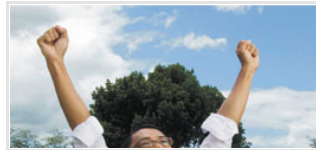
Dear Professors At NYU: Embrace Our In-Class Internet Usage