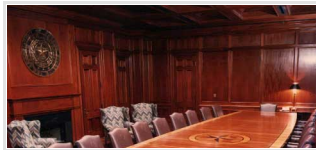
NYU Trustees' Companies Reap Millions In University Contracts